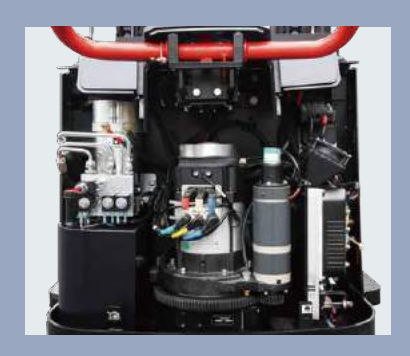
Back cover can be opened fully