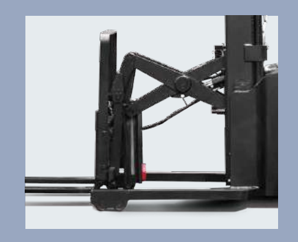
Forks move forward by the scissor