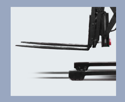
Proportional controlled forks can be operated more accurately