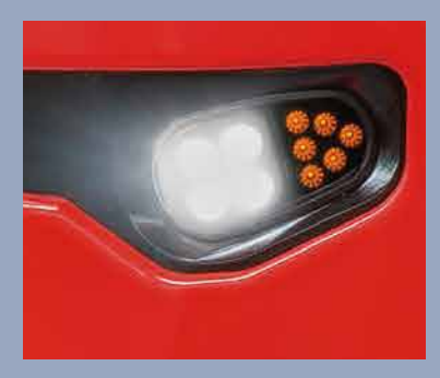
Reliable LED lighting