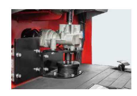
Electronic power steering system (for stand-up driving type tractor)