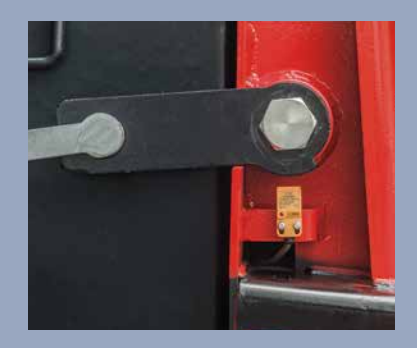
The locking device of the battery is provided with the safety protection function. Only if the locking device i rotated in place, the tractor can tray