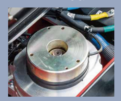
Electrical Park Brake (EPB) syste