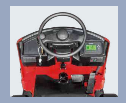
Modern outline design with LCD instrument and USB charging po