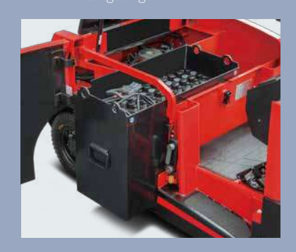
Battery side roll out is taken as the standard configuration in order to easily and fast replace the battery