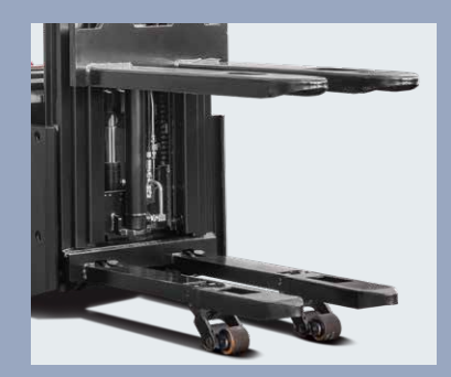
With the upper and lower pallet handling design to meet the stacking operation need and enable a higher efficiency of goods handling