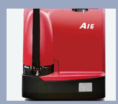
Designed to be narrow with large round corners to improve suitability for concentrated shelves and with a wedge-shape chassis to provide higher passing ability