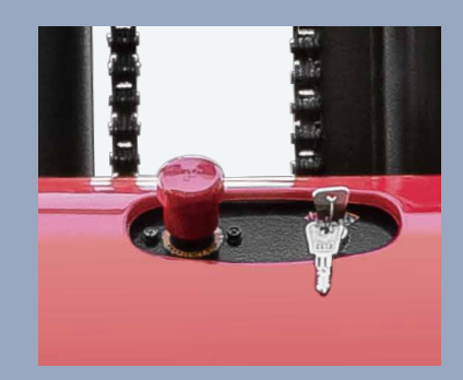
The non-contact proximity switch has a long life and can work reliably