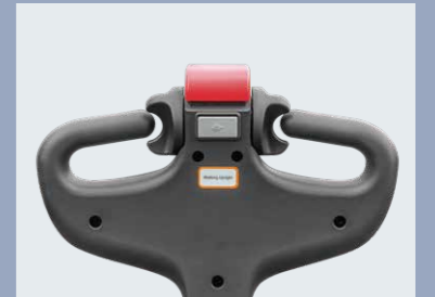
The upright-tiller running function allows it to work within confined space, such as container