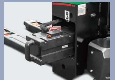
Easy for exchanging battery