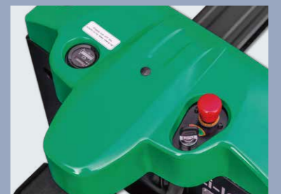
Body feature smooth lines and affluent sense of movement, and compact profile, in accord with the latest appearance design trend