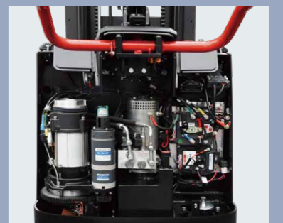
Back cover can be opened fully, and all components and parts are clear at a glance, which is very convenient for maintenance of the entire machine