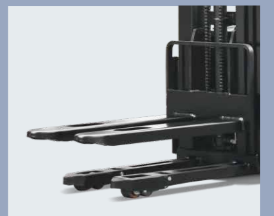
Tandem load wheel