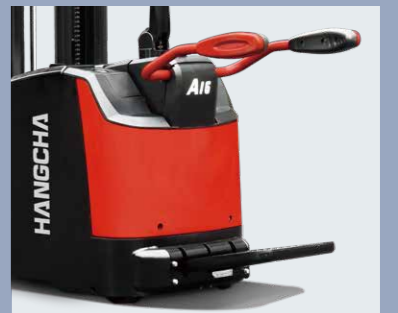
The integrated stamping molded guardrail offers better protection for the operator