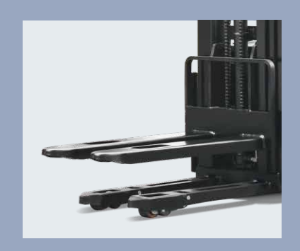
Tandem load whee