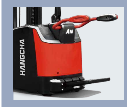
The integrated stamping molded guardrail offers better protection for the operator