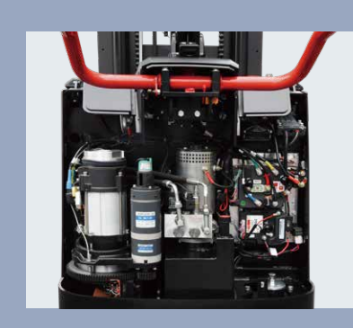
Back cover can be opened fully, and a components and parts are clear at a glance, which is very convenient for maintenance of the entire machine