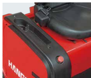
Cup holder, tool box